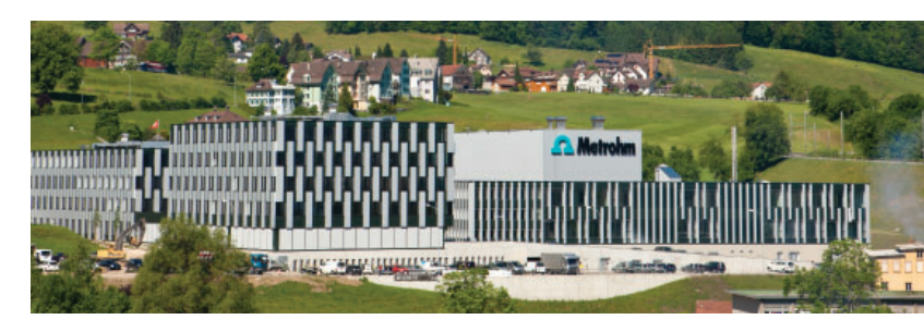
Metrohm Autolab is a member of the Metrohm Group, manufacturers of high-precision instruments for chemical analysis.