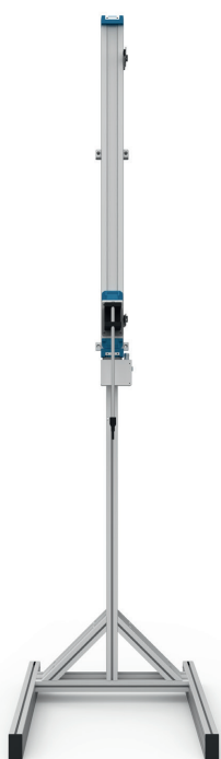
Single Vessel Extra Large