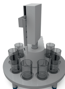
Multi Vessel Small