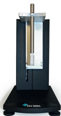
Single Vessel Small