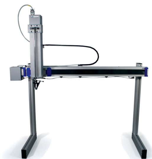
Multi Vessel Medium/Large