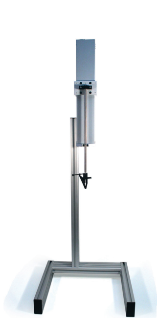
Single Vessel Medium/Large