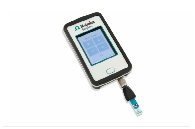
Figure 1. The DROPSTATPLUS instrument and CASTDIR used to connect screen-printed electrodes.

Measurements were performed using DROPSTATPLUS and CASTDIR connectors for screen-printed electrodes ( Figure 1 ).