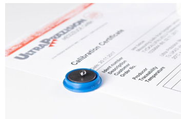
Calibration ball (C216)

A constant temperature stand-alone bath/circulator for sample liquid temperature regulation. Serial port connection. Temperature range -28 to +200°C. Stability \pm 0.01^\circ\text{C} . Digital readout.