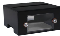
Measuring chamber, room temperature (C202)

Room temperature measuring chamber for environmental protection (e.g. air flow) of substrate and drop.