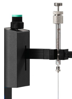
Manual Precision Syringe Dispenser (C205M) with the Manual Dispenser Holder (T221)

Allows attachment of one or two automated disposable tip dispenser C320 to T221A. With two dispensers, automated SFE calculations are possible.