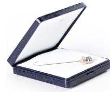
Hooked needle for C205 and C205A/C201, gauge 22 (C210-22)