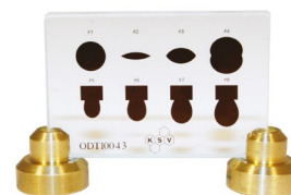
Contact angle and surface calibration pack (C216A)

Contact angle and surface tension calibration verification pack. Comes with certification.