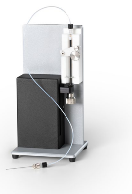
Automatic Single Liquid Dispenser (C201)