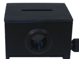
Liquid/liquid chamber, fluid bath heated, 100° C (C217W)

Thermostatted fluid bath liquid/liquid measuring chamber. Can be used for liquid/liquid contact angle studies. Requires fluid bath.