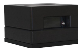
Measuring chamber, fluid bath heated, 110° C (C203W)

Thermostatted fluid bath measuring chamber for air phase temperature control of substrate and drop. Requires fluid bath.