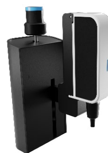
Automatic Disposable Tip Dispenser (C320) with the Manual Dispenser Holder (T221A) with Disposable tip dispenser holder for T221A (T223A)