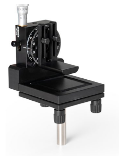
Tilting stage C218

Tilting stage with manual tilting. Used for studying dynamic contact angles. Tilting range from 0 to 90°. Coarse and fine tilting movement.