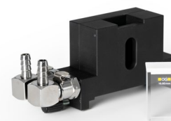
Fluid bath heated cuvette chamber for interfacial tension studies with separate cuvette, 100°C (C208W)

For measurement of interfacial tension between two liquids by pendant/raising drop method also at high temperature.