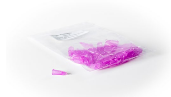
Needle adapter pack for C311-300 (C514DCA)

Extended checklist for ensuring that the instrument has been installed correctly (IQ) and that it is operating correctly (OQ).