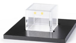
Large cuvette for high temperature (C208A)

Calibration pack with certified calibration ball made to NIST No.821/263669-00 including original certificate document.